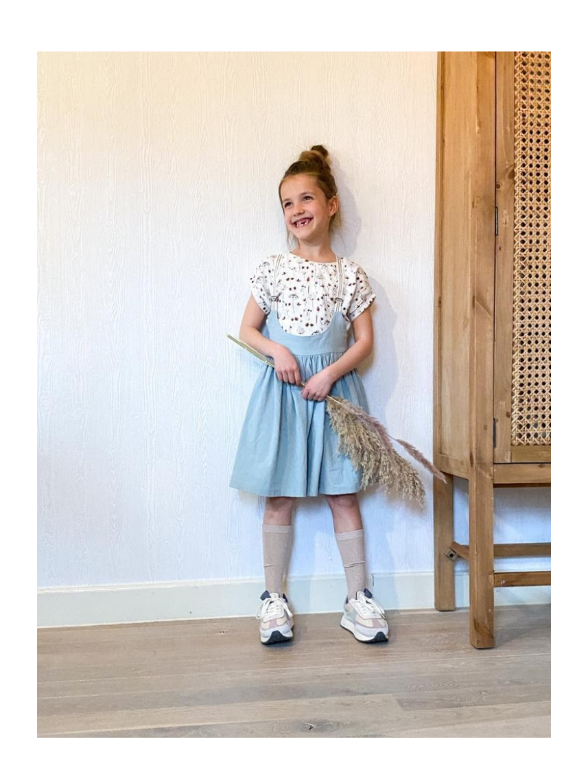
Eva free pattern