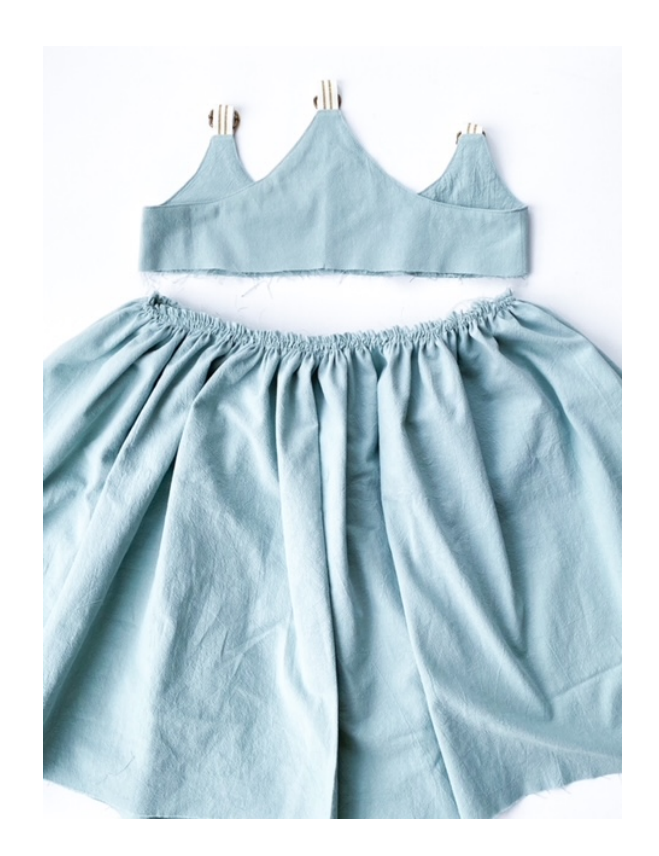
STEP 9: Pin the top to the skirt right sides together. Make sure the cuts and side seams match and that the wrinkles are evenly divided.

STEP 8: Gather the skirt pieces evenly until they are the same width as the top piece and tie a knot at the end so it doesn't move.