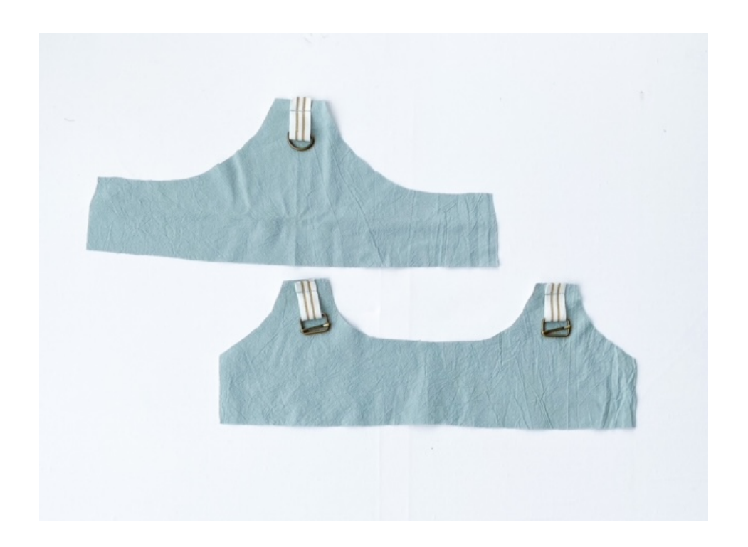
STEP 3: Place the right side of the front on the right side of the back. Do the same with the lining. Pin the side seams and sew. Iron the seams and turn.