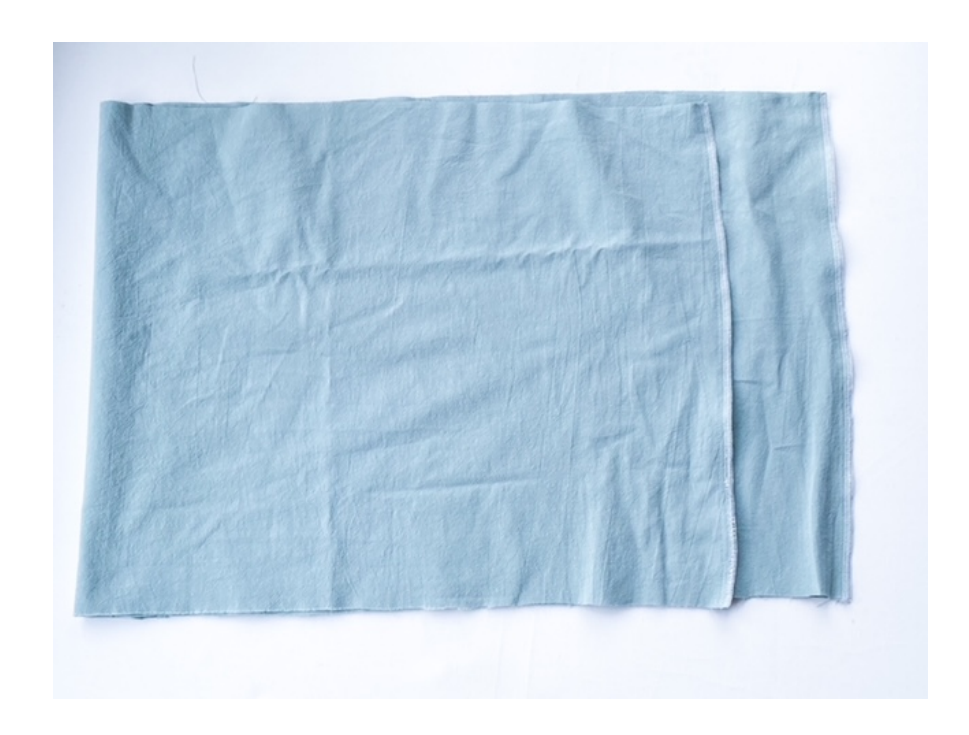
STEP 7: Mark mid front and mid back of skirt pieces and top piece with a small cut. Sew the two gathering threads at the top of the skirt parts at 0.5 cm and 1.5 cm.

STEP 6: Take the two rectangle skirt pieces and place the right sides together. Pin the side seams and then sew them. Serge or zigzag the side seams. Iron the seams nicely flat.