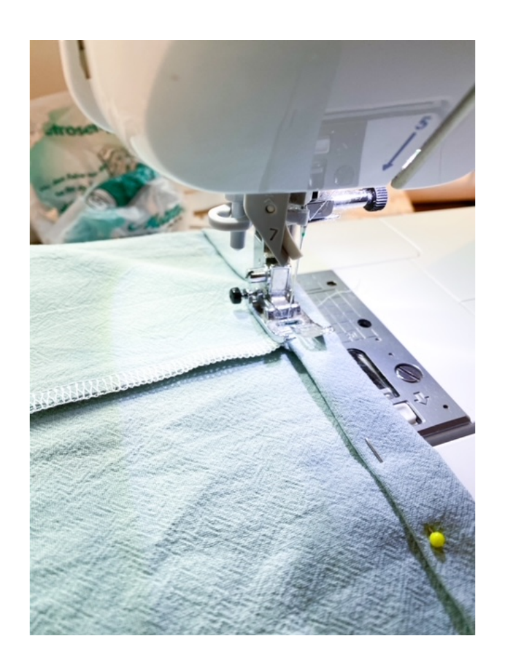
STEP 13: Take the long ribbon and make a small hem at both ends.