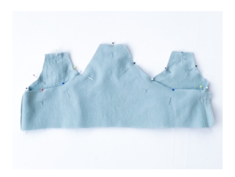
STEP 5 : Stitch the panels together. Cut away the corners at the points and cut the curves. Turn the top right side up and iron. Topstitch the seam of the top piece at 2 mm from the edge. Your top is now ready.